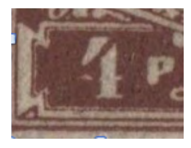
Figure 2: 4R with broken 4

In the Samovar thread, member CEC 71 noted several print varieties on the 3, 5 and 20 ruble stamps. Since scans of these varieties were not shown I have included them in Figures 3 through 13.